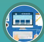
Create a Website