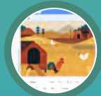
Introduction to Scratch Lab