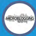
Build your own social microblogging site