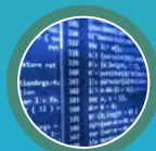
Input, Processing, Outputs