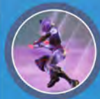
Gravity Jump App