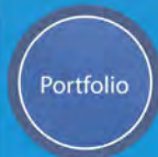
Build your portfolio App