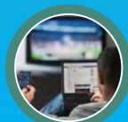
Design Multi Screen App