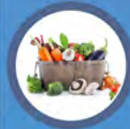
Build a responsive vegetable website using HTML