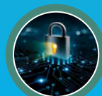
Computers and Security