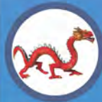
Train Your Dragon